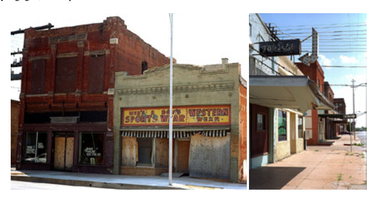
What was once a thriving, largely Jewish, commercial area is barely breathing now. Wichita Falls like almost every other town and city has disbursed to its periphery.

Reform congregations were generally more socially ambitious and culturally sophisticated than Orthodox congregations. This building is architecturally distant from the simple wooden shed that housed Beth Jacob. From the entrance one goes down 1/2 level to the social and up 1/2 level to the sanctuary, entering behind the bimah and choir loft. The nicely proportioned sanctuary is accented with exposed (clad) structural roof members and tension rods, embellished with "Magen-David" turnbuckles. Many of the details turn up the in the later Breckenridge's synagogue, also a product of an oil boom.