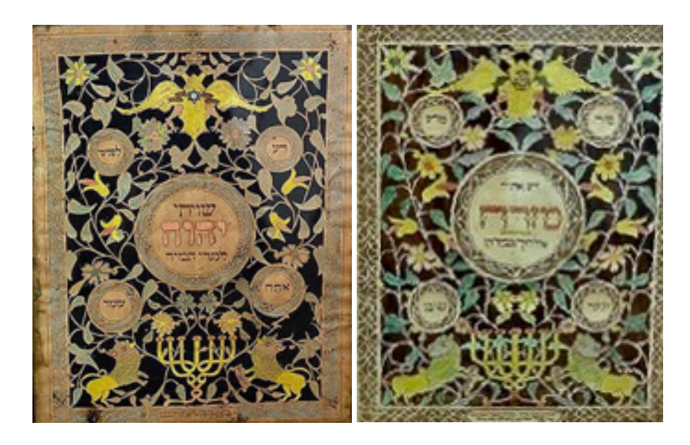
Paper-cut and water-colored Mizrachs made by the rebbetzin sometime before WWII. These and others of Torah sages and similar Jewish themes and subjects hang throughout the shul.