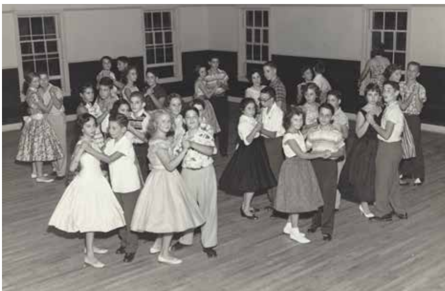
Waco Teenagers – early 1950s.