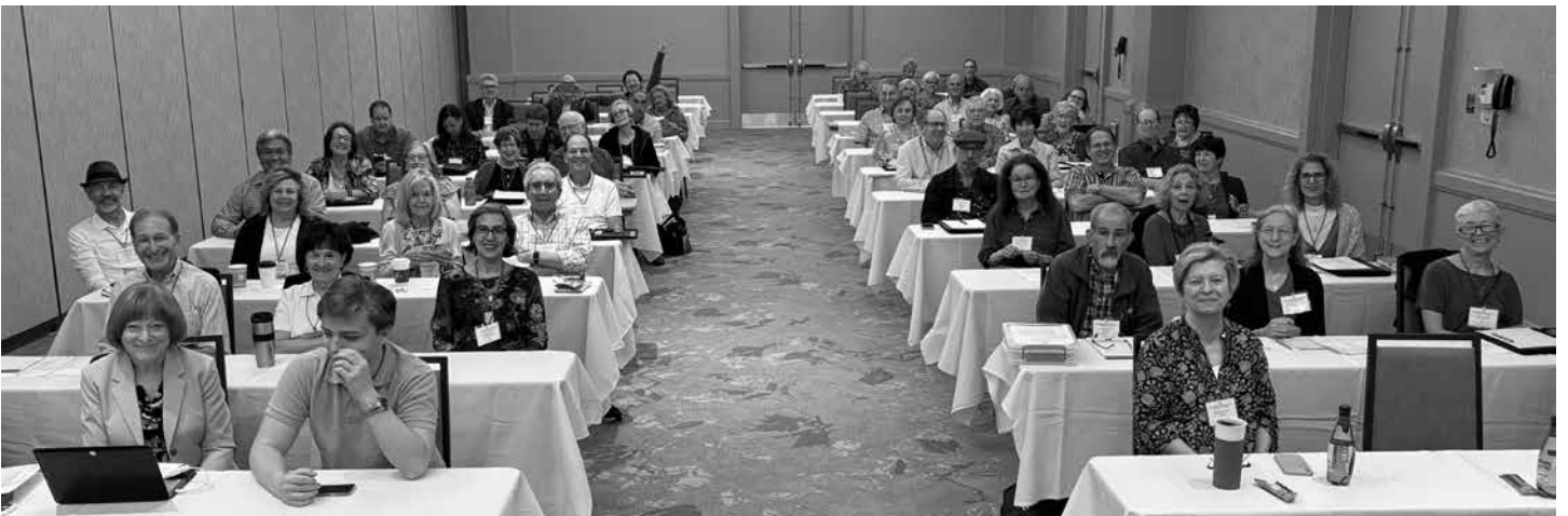
Sunday Morning Meeting.