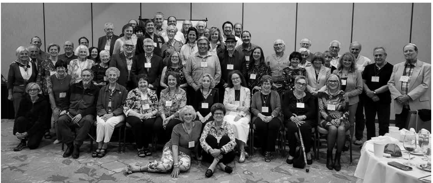
Saturday night dinner attendees.