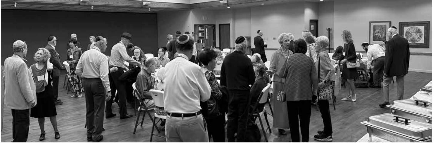
Friday night dinner at Congregation Beth Torah.