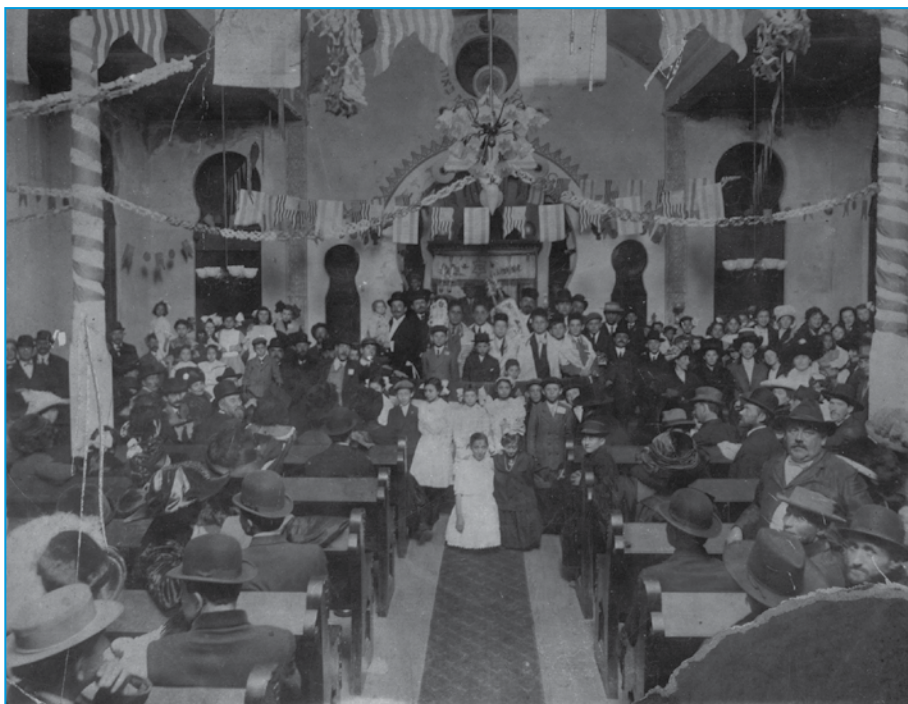
Congregation Agudath Jacob Synagogue.