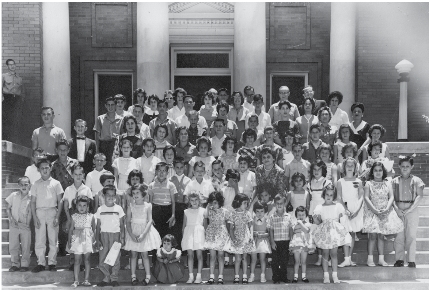
Rodef Shalom.