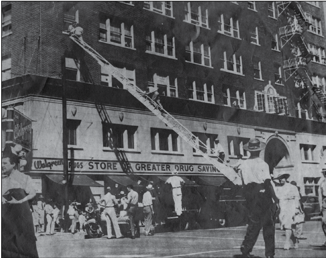
Walgreen Drug Store.