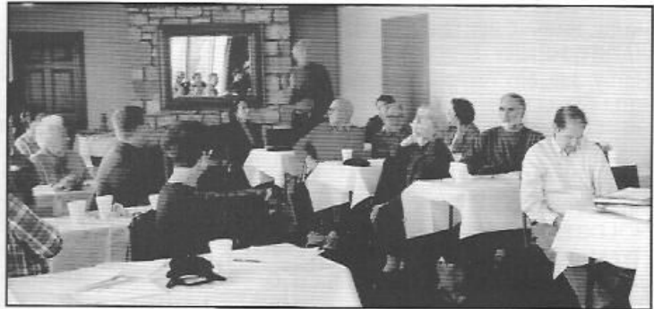
Winter 2006 Quarterly Board of Directors Meeting at the Stagecoach Inn, Salado, Texas