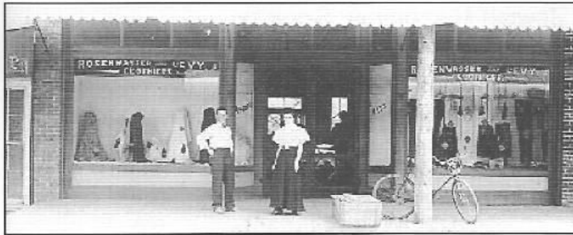
Rossenwasser & Levy - Ballinger, 1911