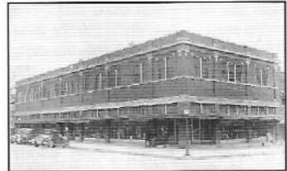
Levy's Sweetwater 1928