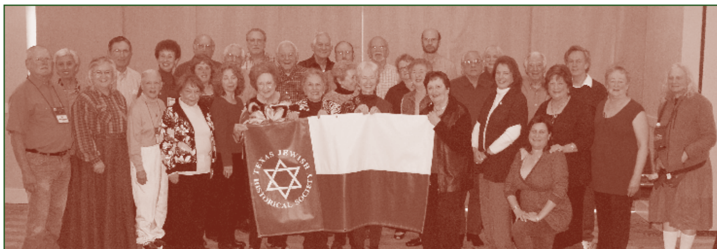
Members who attended the meeting weekend.