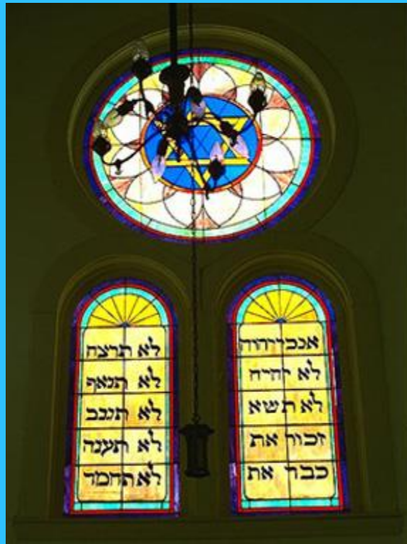
The rose window with Magen David and the Ten Commandments below were manufactured in the studio of Louis Comfort Tiffany.